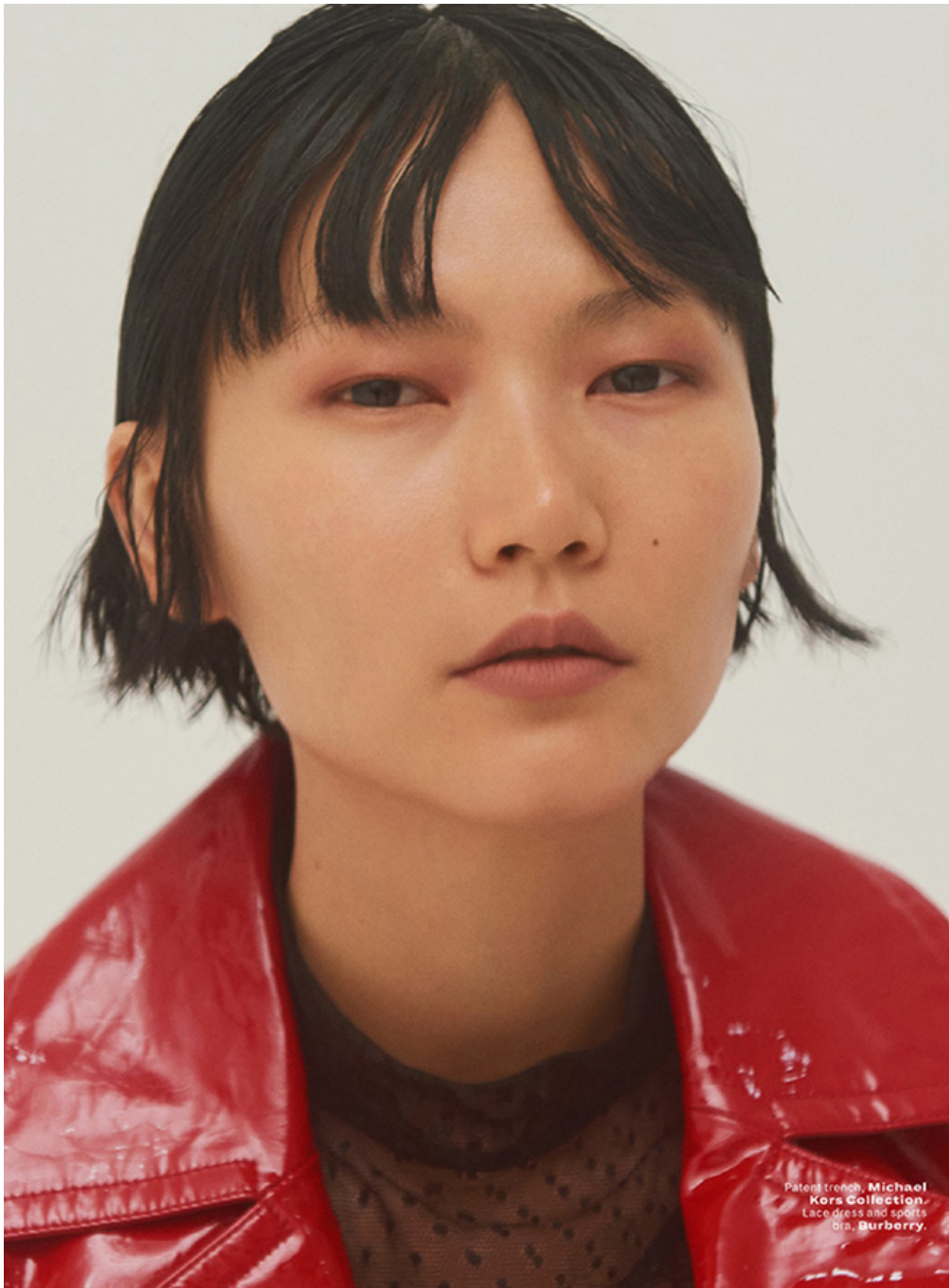
Patent trench, Michael Kors Collection. Lace dress and sports bra, Burberry.